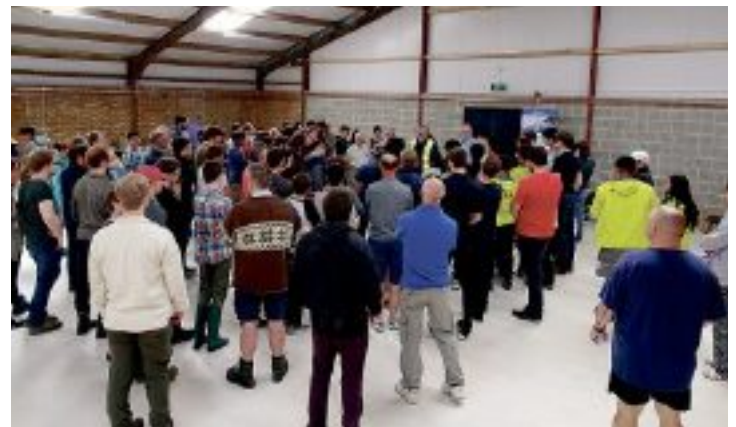
Team briefing in the Event room on Saturday morning.