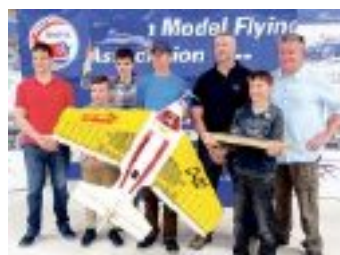
D02 - Time & Space Learning 'Aeronauts' sleek class-winning swept-wing balsa-block carrier won the Distance class.

W13 Hebei Institute of Technology (China)'s yellow water-carrier's first unladen flight was exciting! I'll swear it took off vertically with no taxi-run! Whilst in the air there was some linguistic confusion regarding the circuit requirements but a successful flight was completed. Its 2nd Round flight was uneventful but marked the first successful flight of the weekend with a 2kg load. Sunday's 3rd Round effort carrying 4kg was less successful - after a very long take-off run the model completed