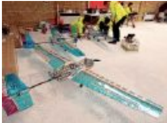
Not one, not two, but three Q01 Quantity models in Ningxia University's pit area.

Ningxia University (from near the Chinese city of Xian – think Terracotta Army) were a large team surrounded by huge number of models e.g. three of their Quantity entry in pale blue translucent film over super-light carbon rod and laser-cut former construction.