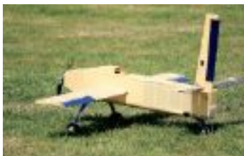
Loaded and ready for take-off – Q09 City University of London folding 'Lady Killerz'

City University of London 'Lady Killerz' team's small cream and blue model also had a folding prop. Designed for the American AIEE competition, which entails a hand launch and a weight payload, in this case eight hockey pucks, but this only translated to 3 tennis balls when modified for the Quantity comp. For the US competition the model has to fit in a tube – and it still does! The tiny model has the look of a 1930s racer and was never going to win the ball-carrying contest but full marks for entering into the spirit of the comp. and in the event the model provided some of the best entertainment of the weekend!