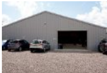
The big National Centre Event room a.k.a. 'The Hangar'.

slightly mixed feelings about the venue change, for selfish reasons – the previous events have all been held at Elvington Airfield near York, which is only half-an-hour down the road from my home – actually it is an awesome venue in its own right, with its 2-mile runway, massive concrete holding area and Air Museum next door.