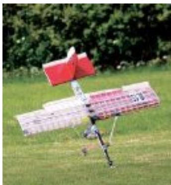
W15 Phoenix 2, Coventry Uni's long-nosed model, crashed in testing on Friday and again, here, on Sunday.

which would have given a total of 250 but they had to settle for 200 again. However their running total after two rounds was now 400 compared to Q11 Hebei's 364 - this one could have been close! The third attempt saw a slight problem on loading the fourth load after three good flights (but with the simple gearbox sounding noisier each flight), then a crash in the wind on the 5th approach for what would have been the team's best round. Another massive score of 200. 111 points.