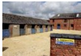
Off limits - the stables and outbuildings – plans are afoot to renovate these too.

BUT, I was also desperate to see the new National Visitor Centre so what better opportunity? But where to stay? I ended up spending the two nights, on my own, in my brother-in-law's floating gin palace (aka motor boat) on a marina (aka gravel pit) near Newark, only 20 miles from Sewstern. So that worked very well, apart from the incessant drip drip of a leaking roof-light in the torrential rain on Friday night!!