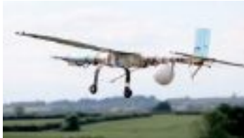
Successful proving-flight with empty water bottles by W14 'Phoenix 1'.

Coventry Uni's Engineering Dept 'Phoenix 1' team had a large slender craft made of blue foam, balsa and black electrician's tape. With tapered wings and a large carbon undercarriage, the model looked like a contender.