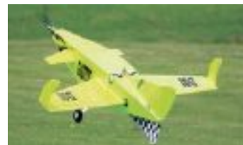
D01 Gavin's greatest moment...

West Bridgford School – the enthusiastic School Aeromodelling Club and their teacher brought a huge luminous yellow balsa-carrying canard model – 'Gavin', the Greatest Aerial Vehicle In Nottingham!