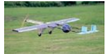
'Liverbird's' W08 makes a successful proving-flight take-off.

University of Liverpool 'Liverbird' team's large purple/ black twin-boom twin-fin model looked nicely (and lightly) constructed, with laser-cut lite-ply and blue foam tail feathers.