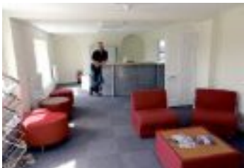
Manny in the brand-new Reception area – frugally furnished.

Flying Site at Buckminster Lodge in Sewstern near Grantham in Lincs.