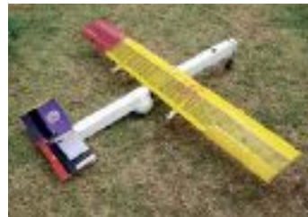
W06 – Loughborough University's only Weight entry this year.

This was Loughborough Uni's only entry to arrive at the contest this year – three other teams had hoped to attend but loss of workshop facilities meant they didn't enter a model. W06 was a nicely constructed long-bodied and wide-span entry which looked business-like.