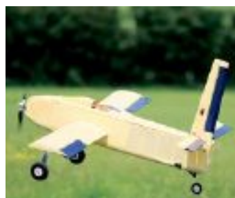
Q09 City University of London 'Lady Killerz' folding model was designed for the American AIEE competition - for the US competition the model has to fit in a tube.

strip, causing (or because of) a 90-degree twist in the nose-wheel, but this round counted, for a smaller single flight total of 64. Perhaps because of this the team were on a mission for Round 3, their pilot flying very low and level and making a hugely impressive 5 successful load-carrying flights, plus a sixth with a smaller payload after fumbled