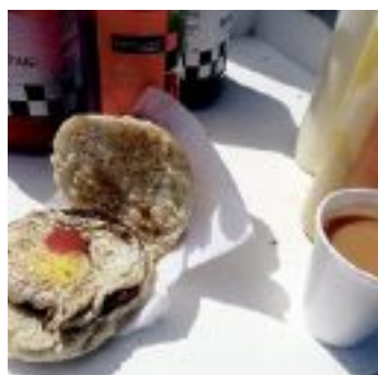
My 'Breakfast of Champions'!