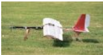
W15 Phoenix 2, Coventry Uni's long-nosed model had crashed in testing on Friday.

Coventry Uni's Engineering Dept 'Phoenix 1' team had a large slender craft made of blue foam, balsa and black electrician's tape. With tapered wings and a large carbon undercarriage, the model looked like a contender.