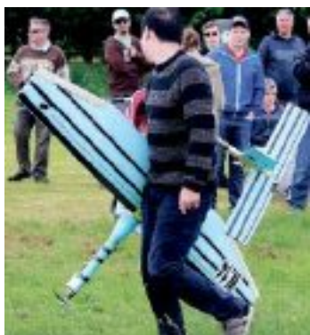
W14 Coventry Uni's Engineering Dept 'Phoenix 1' team's large slender craft was made of blue foam, balsa and black electrician's tape. This was the result of trying to carry 3kg on Sunday.