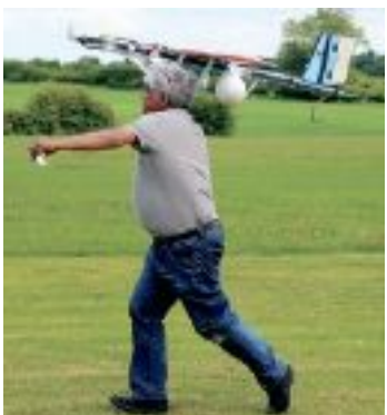
Coventry's team leader was allowed to try an unofficial hand-launch with W16 after the u/c failed, but the flight didn't end well.

approach saw the hatch open and most of the balls pop out of the top! An awesome 320 ball total for Round 3 which was a new Quantity Challenge Record. 161 points and class win.