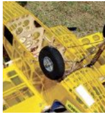
This is the University of South Wales' Q05 entry with its hatch cover off. Although computer designed and laser-cut, it is of traditional construction even down to the sewn hinges – note the flaps and complex sprung/ damped u/c.

University of Derby Engineering Dept's small-ish 'Fly Derby' entry was of blue foam construction with orange trim and had a CNC-routed symmetrical-section wing of odd cross-section – think tall isosceles triangle with a slightly rounded base, on its side...!