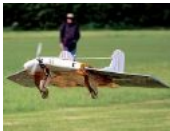
This is Time & Space Learning's 'Aeronauts' Q02 giant delta model which had a removable central trailing edge ball loading system.

In Round 2, the model tipped up on landing after its first flight and lost most of its balls on the