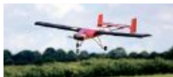
The 'Comet' team's Q12 on approach after a very successful first-round ball-carrying flight.

Hebei (China) Institute of Technology's team had spare yellow/ red models in both Quantity and Weight classes. The extremely large and light Q11 model had a potential carrying capacity of 64 tennis balls! The oval cross-section fuselage had been designed to give an aerodynamic advantage, we learned in the team's presentation. Beautifully constructed of carbon, balsa and lite-ply with a geared motor, this would be one to watch.