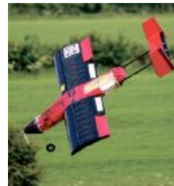
University of Hertfordshire 'Comet' team's Q12 wide-bodied twin boom Quantity entry on a dicey approach.