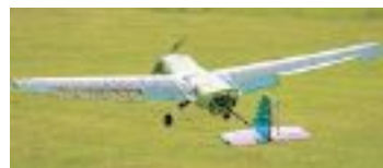
Ningxia University's beautifully constructed carbon and laser-cut Q01 Quantity tennis-ball carrier on take-off.