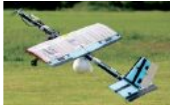
W16 'Phoenix 3', also from Coventry, was constructed of blue foam with clear covered open-structure balsa wings and a functional-looking undercarriage.

Phoenix 2, Coventry Uni's long-nosed red and white model had crashed in testing on Friday. Fixed for Saturday, it had an immensely long fuselage and a very long wheelbase (forward-positioned front u/c), which looked to me as though it might cause some problems with rotation at take-off.