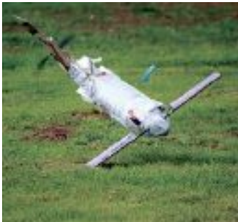
W05 Loughborough Team 2's purple canard - on its first unladen attempt, the nose-wheel collapsed and the craft exploded in a shower of bits - the wings are out of shot!