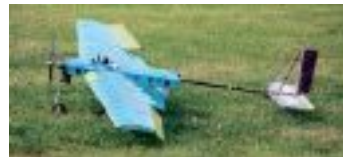
Ningxia University's small, lightly built W01 Weight entry ready for take-off.