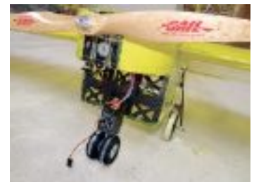
Business end of Ningxia's W13 water-carrier – note simple gearbox in the carbon nose-structure.

University of Liverpool 'Liverbird' team's large purple/ black twin-boom twin-fin model looked nicely (and lightly) constructed, with laser-cut lite-ply and blue foam tail feathers.