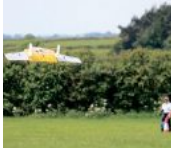
'Aeronauts' Q02 delta takes to the air at the Buckminster field watched by a hard-working marshal.

Time & Space Learning's Aeronauts fielded a giant silver/ yellow delta model in balsa, lite-ply and foam which had a removable central trailing edge to load and unload the tennis ball payload.