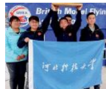
All smiles! 64 tennis balls carried in their best flight - awesome achievement.