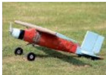
Q03 'Fly Derby's ball-carrier ready for action on the strip.

University of Derby Engineering Dept's small-ish 'Fly Derby' entry was of blue foam construction with orange trim and had a CNC-routed symmetrical-section wing of odd cross-section – think tall isosceles triangle with a slightly rounded base, on its side...!