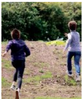
West Bridgford School recovers a stricken 'Gavin'.