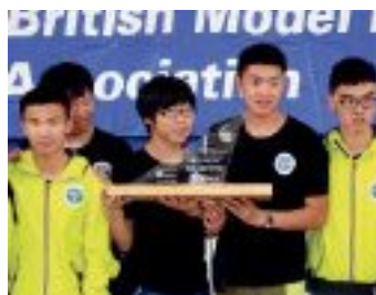
Despite the fact that it says 'Quantity' on the trophy (last year's winners having failed to return theirs as yet), this is Ningxia Uni receiving their prize for winning the Weight class.