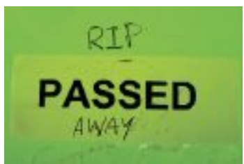
RIP Gavin 1 - West Bridgford's scrutineering sticker, post-comp.