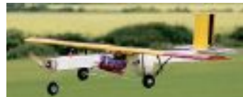
Loughborough's W06 approaches the strip after a successful second-round payload carrying flight.

Ningxia University's pale blue translucent film-covered Weight entry was small, lightly built and looked very purposeful. Lots of carbon and lightening holes in evidence, with tapered wings plus a direct-drive prop.