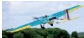
W01 from Ningxia Uni on its unladen proving flight.

Ningxia University's pale blue translucent film-covered Weight entry was small, lightly built and looked very purposeful. Lots of carbon and lightening holes in evidence, with tapered wings plus a direct-drive prop.