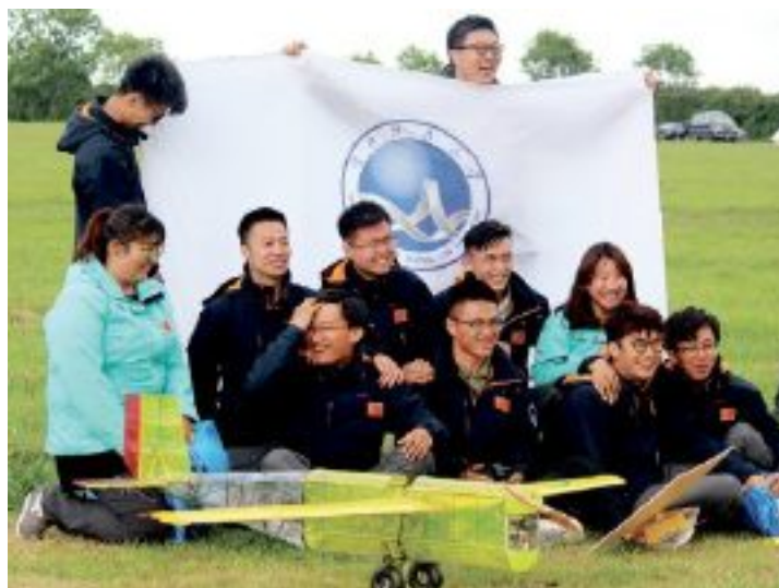
Hebei (China) Institute of Technology's team. Their extremely large and light Q11 model, fully-laden with 64 balls(!) outclassed even Ningxia Uni to win Quantity.