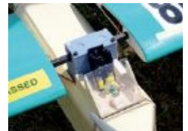
Computer printed folding wing mechanism on City University of London's 'Ball Boys' team Q08 entry. Plus Lego Hans Moleman pilot clutching a void Driving Licence...

My old alma mater, Manchester University's School of Mechanical, Aerospace and Civil Engineering brought a small boxy pink/ blue/ white model with upswept wingtips reminiscent of (or taken from?) an HK Bixler or similar. The model failed scrutineering several times but eventually fought its way through.