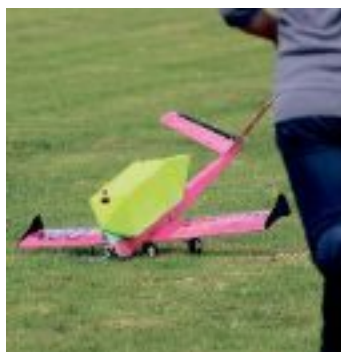
West Bridgford School's 'Gavin 2' makes a 3 point landing!

The flying reports are arranged in progressive order of Distance,