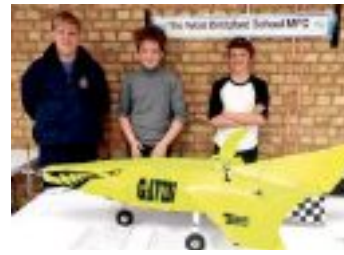
D01 West Bridgford School's Distance entry – 'Gavin', the Greatest Aerial Vehicle In Nottingham!