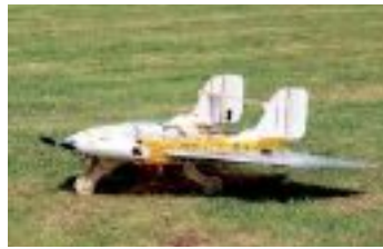
This is Time & Space Learning's 'Aeronauts' Q02 giant delta model in which had a removable central trailing edge ball loading system.

The aircraft were slightly scruffy but of very light build and looked very similar in design to last year's Quantity-winning craft fielded by Beijing's Beihang Uni team, with the same huge 50-ball carrying capacity.