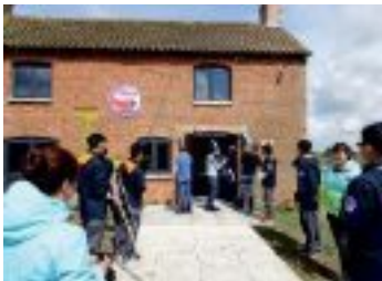
Teams queue patiently outside the BMFA offices for scrutineering on Saturday a.m.

Two great opportunities in one presented themselves in June of this year. Firstly, I was asked to review the annual BMFA University and Schools Payload Challenge, which is always one of my favourite weekends of the year. Secondly, the event was to be held, for the first time, at the brand spanking new BMFA National Visitor Centre and