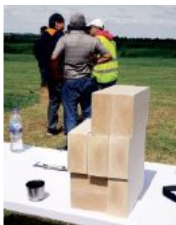
Reason for the world balsa shortage – Distance models have to carry TWO of these blocks for a total of half a kilogram weight!