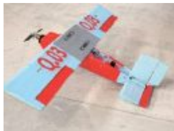
Q03 is University of Derby Engineering Dept's small-ish 'Fly Derby' entry.

Time & Space Learning's Aeronauts fielded a giant silver/ yellow delta model in balsa, lite-ply and foam which had a removable central trailing edge to load and unload the tennis ball payload.