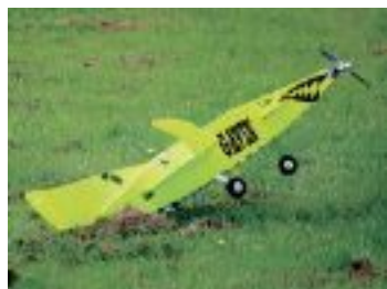
Oops! D01 West Bridgford School's 'Gavin', the Greatest Aerial Vehicle In Nottingham, bites the dust!

site for the competition with excellent facilities and a great flying area, off grass – all in all, a brilliant venue for this challenging annual event. In the last issue we looked at the teams, their models and the preliminaries, plus an overview of the new centre. This time it's down to the action from the two days' competitive flying. If you want to see pretty pictures of smiling teams and their models, check out the last instalment – this time its thrills, spills and action all the way!