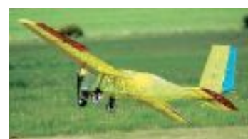
Ningxia's ill-fated W13 Weight entrant looked entirely functional & efficient in the air. Big prop on a geared motor.