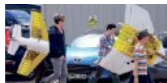
Nail-biting stuff – the 'Aeronauts' team take D01 Distance and Q01 Quantity models to Scrutineering.

West Bridgford School – the enthusiastic School Aeromodelling Club and their teacher brought a huge luminous yellow balsa-carrying canard model – 'Gavin', the Greatest Aerial Vehicle In Nottingham!