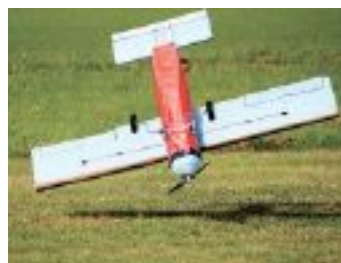
This might not end well! University of Derby Engineering Dept's smallish Q03 'Fly Derby' entry.