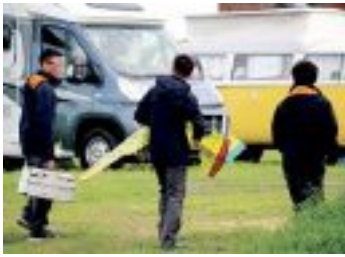
Disappointed Ningxia students remove the damaged W13 craft.

loading, but the team ran out of time 5 seconds before landing. The negative g of a hurried