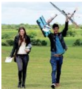
Sad end for W16 'Phoenix 3'.