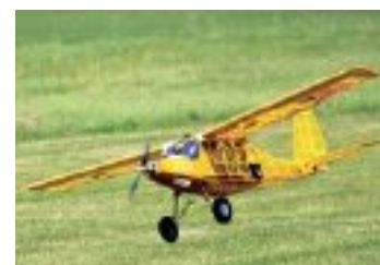
Pilot Tim Rowe lands Q05, the University of South Wales' traditionally -constructed, Cub-inspired model.