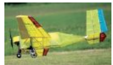
Ningxia's W13 Weight entrant looks entirely functional & efficient in the air.