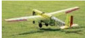
Slow and stately in take-off - fully-laden (64 balls...) Q11 Quantity entry for Hebei.

Hebei (China) Institute of Technology's team had spare yellow/ red models in both Quantity and Weight classes. The extremely large and light Q11 model had a potential carrying capacity of 64 tennis balls! The oval cross-section fuselage had been designed to give an aerodynamic advantage, we learned in the team's presentation. Beautifully constructed of carbon, balsa and lite-ply with a geared motor, this would be one to watch.