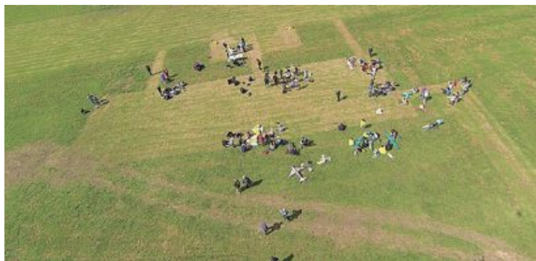
Drone shot of The National Centre flying site.