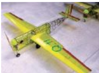
Hebei (China) Institute of Technology team's extremely large and light Q11 Quantity model.

City University of London 'Lady Killerz' team's small cream and blue model also had a folding prop. Designed for the American AIEE competition, which entails a hand launch and a weight payload, in this case eight hockey pucks, but this only translated to 3 tennis balls when modified for the Quantity comp. For the US competition the model has to fit in a tube – and it still does! The tiny model has the look of a 1930s racer and was never going to win the ball-carrying contest but full marks for entering into the spirit of the comp. and in the event the model provided some of the best entertainment of the weekend!