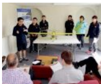
Ningxia Uni students give their Q11 Quantity model's presentation – in English. Impressive performance.