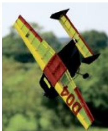
Incoming! This is Beihang Wenhui Middle School's ill-fated D04 Distance entry.

“ West Bridgford School – their luminous yellow canard model was christened ‘Gavin’, the Greatest Aerial Vehicle In Nottingham! ”