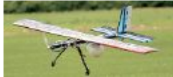
Coventry's W16 'Phoenix 3' looked stable in the air on its proving flight.

Phoenix 3, again from Coventry, was also largely of blue foam with clear covered open-structure balsa wings. It too had a very long fuselage but a more functional-looking undercarriage – time would tell.