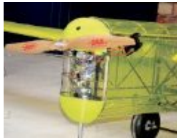
Close-up of the business end of Hebei's Q11 Quantity entry.