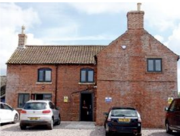
BMFA Buckminster's newly renovated Reception area and Office facility.