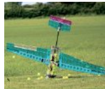
Balls! Ningxia's Q01 Quantity entry sheds it's load on a windy 5th flight in their otherwise brilliant 3rd round.

strip, causing (or because of) a 90-degree twist in the nose-wheel, but this round counted, for a smaller single flight total of 64. Perhaps because of this the team were on a mission for Round 3, their pilot flying very low and level and making a hugely impressive 5 successful load-carrying flights, plus a sixth with a smaller payload after fumbled