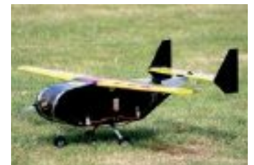
D04 Wenhui School's Distance entry ready to fly, on the apron.

Beijing Wenhui Middle School – yes, these young secondary-age students had come all the way from China with their team managers. Looking very smart in school blazers and ties, their black and yellow twin-fin model looked extremely functional and well constructed.