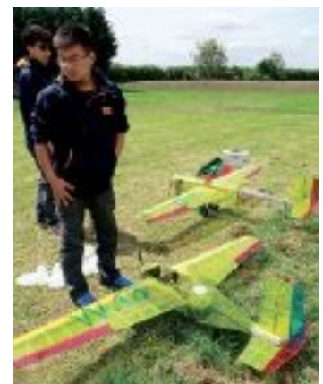
Ningxia students look preoccupied as they prepare W13 (foreground) and Q11.

Hebei Institute of Technology's yellow (with red and blue trim) water-carrier had the only geared motor in the class. It seemed to be mainly made of air! It had more lightening holes and carbon than you could shake a stick at. Not elegant but highly purposeful-looking..