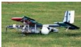
W16 'Phoenix 3' from Coventry, constructed from blue foam with clear covered open-structure balsa wings, lost its u/c on one of several crashes.

Round 2 saw the team very nearly succeeding in completing 5 laps