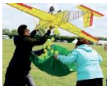
Manic but effective blanket unload system by Hebei in Quantity.