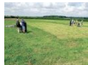
The National Centre flying site – pilots' area in front of the temporary runway in the far distance of the shot.