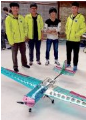
Ningxia University chose to use the one with the pink nose! Beautifully constructed Q01 Quantity tennis-ball carrier.

Ningxia University (from near the Chinese city of Xian – think Terracotta Army) were a large team surrounded by huge number of models e.g. three of their Quantity entry in pale blue translucent film over super-light carbon rod and laser-cut former construction.