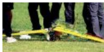
Ningxia's W13 Weight model was unable to carry 4kg - it completed half a lap before cart-wheeling in on the final round. An excellent 2nd place was their reward.