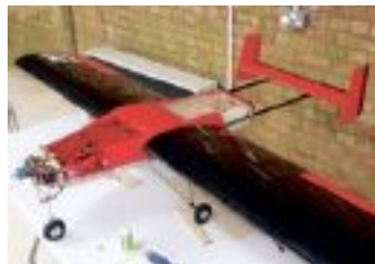
Repaired for Saturday – University of Hertfordshire 'Comet' team's Q12 wide-bodied twin boom Quantity entry.

University of Hertfordshire 'Comet' team's wide-bodied black/ red twin boom entry had crashed in testing on Friday and lost its undercarriage but this had been mended after the enthusiastic team worked through the night.