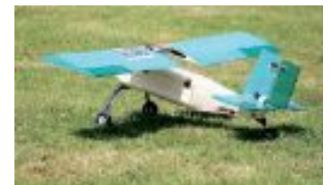
'Ball Boys' Q08 waiting for its slot on the landing strip.

City University of London's 'Ball Boys' team produced a small cream and turquoise craft with folding wings and a folding prop. The model was adapted from the rules of another competition as per Q09 below. The model lost its undercarriage in testing on Friday but was repaired for the contest.