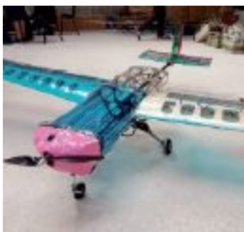
A closer look at Q01 Quantity showing some of the carbon and laser-cut construction.

The aircraft were slightly scruffy but of very light build and looked very similar in design to last year's Quantity-winning craft fielded by Beijing's Beihang Uni team, with the same huge 50-ball carrying capacity.