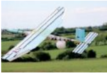
W14 Coventry Uni's Engineering Dept 'Phoenix 1' team's large slender craft was made of blue foam, balsa and black electrician's tape.