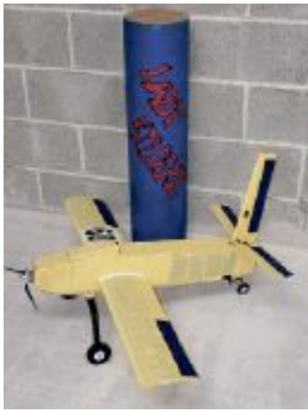
Q09 City University of London 'Lady Killerz' model was designed for the American AIEE competition – for the US competition the model has to fit in the tube behind.