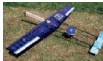
W08 is the University of Liverpool 'Liverbird' team's large nicely-constructed twin-boom twin-fin model.

This was Loughborough Uni's only entry to arrive at the contest this year – three other teams had hoped to attend but loss of workshop facilities meant they didn't enter a model. W06 was a nicely constructed long-bodied and wide-span entry which looked business-like.